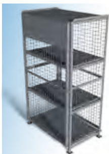
PCSC-B2-GP 39" w x 27" d x 72" h 2 removable shelves