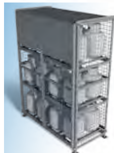
PCSC-D2 51" w x 27" d x 72" h 2 removable shelves