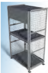
PCSC-B1-GP 39" w x 27" d x 72" h 1 removable shelf