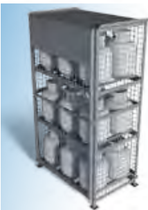
PCSC-B2 39" w x 27" d x 72" h 2 removable shelves