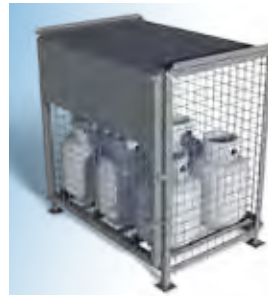
PCSC-A 39" w x 27" d x 40" h