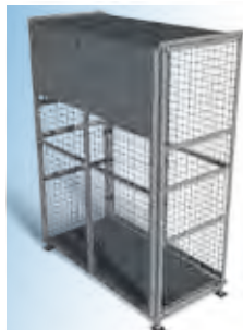
PCSC-D-O/A 51" w x 27" d x 72" h