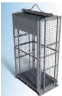
PCCL-B Certified Lifting Device 45" w x 28" d x 82" h