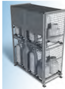
PCSC-D1 51" w x 27" d x 72" h 1 removable shelf