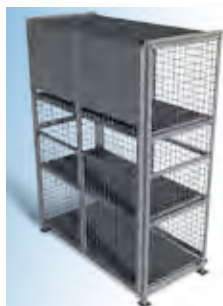
PCSC-D2-GP 51" w x 27" d x 72" h 2 removable shelves