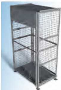
PCSC-B-O/A 39" w x 27" d x 72" h