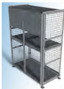
PCSC-D1-GP 51" w x 27" d x 72" h 1 removable shelf