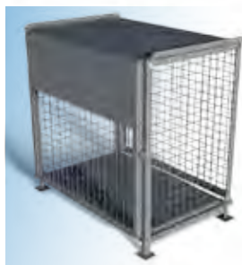
PCSC-A-GP 39" w x 27" d x 40" h