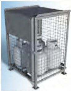
PCSC-A-S 27" w x 27" d x 40" h