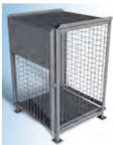
PCSC-A-S-GP 27" w x 27" d x 40" h