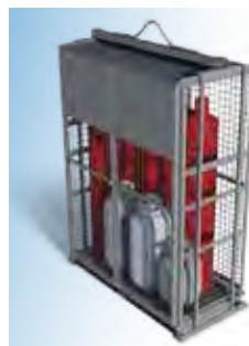
PCCL-D Certified Lifting Device 58" w x 29" d x 82" h