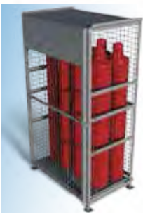
PCSC-B-O/A 39" w x 27" d x 72" h