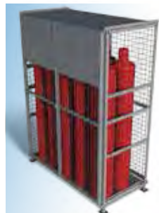
PCSC-D-O/A 51" w x 27" d x 72" h