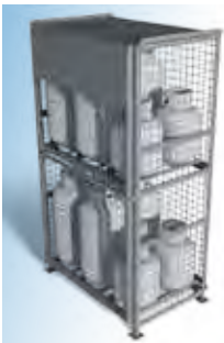
PCSC-B1 39" w x 27" d x 72" h 1 removable shelf