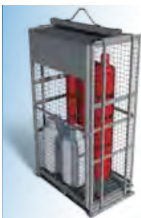
PCCL-B Certified Lifting Device 45" w x 28" d x 82" h